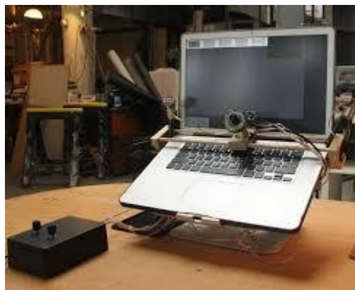
A model of EYEWITER

PS3 Eye Camera: The play station eye camera is a digital device similar to web camera. The technology uses computer vision and gesture recognition to process images taken by the camera. The PS camera is capable of capturing standard video with frame rates of 60Hz at 640x480 pixel resolution and 120Hz at 320x240 pixels. While there is no official support or drivers by Sony to run the play station eye camera to run the play station on other platforms such as PC through getting V-sync(vertical sync of the camera). The v-sync is an electrical signal that comes from the camera which communicates refresh rate. Getting the camera's V-sync is crucial for this application to work because it is only way can match the camera's refresh rate to LED'S.